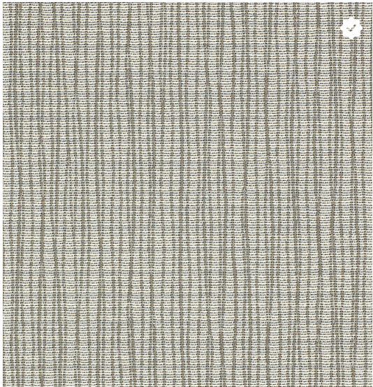
Alpine - ZAX