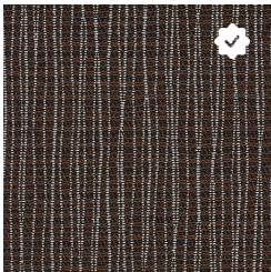
Bark - ZAR