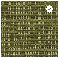
Parrot - ZAY