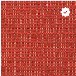
Poppy - ZAT