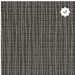
Alloy - ZAW