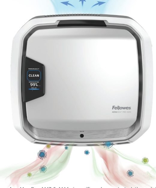
<sup>†</sup>Fellowes AeraMax Pro AM3 & AM4 air purifiers demonstrated, through independent laboratory testing, to be effective in eliminating aerosolized concentration of SAR5-CoV-2 by 99.9999% through a single air pass test of the purifier. In addition, AeraMax Pro air purifiers reached 99.99% airborne reduction of a surrogate Human Coronavirus 229E in a 20m3 test chamber within 1 hour of operation in a separate test.

In a recent test, Fellowes® AeraMax® Pro AM3 and AM4 air purifiers demonstrated to eliminate COVID-19†, using a combination of smart and integrated technologies—only from Fellowes.