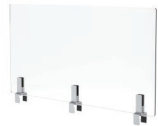
3 brackets for 48" wide panel topper