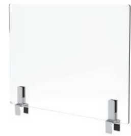
2 brackets for panel toppers up to 42" wide