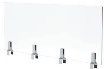
4 brackets for 60" wide panel topper