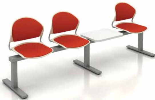
4-position - 34"H x 100"W x 24.25"D

Jet Tandem is part of our complete family of stack, task, stool and café stool models for every space where seating is desired. We've got almost every seating function covered!