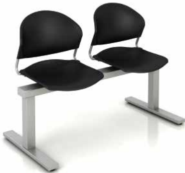
2-position - 34"H x 49.5"W x 24.25"D