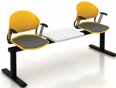
3-position - 34"H x 74"W x 24.25"D