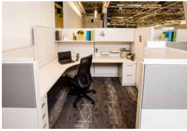
Capture was configured to deliver plenty of privacy within the open office setting.