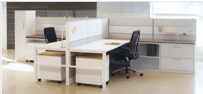
Capture with laminate or steel storage. You choose.