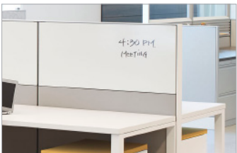
Marker Board tiles allow vertical surfaces to work harder.