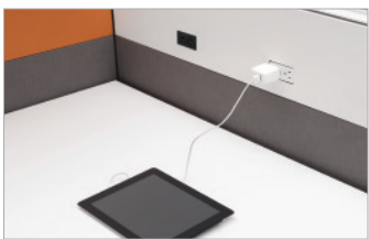
Power and data location options ensure user needs are met.