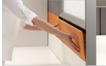
Tiles easily and firmly click into position - no tools required.