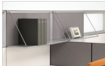
Hanging shelves provide extra storage with a minimalist approach.