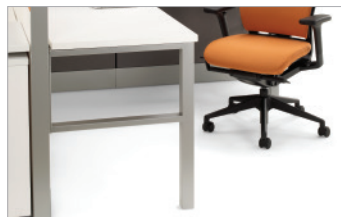
The P-Leg option provides a light, open alternative to end panels.