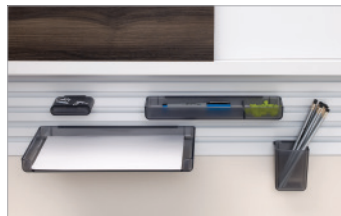
Slatwall and Work Tools get clutter off the work surface and give users more choices. Available in Smoke (shown), or Frost.