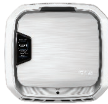
Fellowes® AeraMax® Pro AM3 Air Purifier

22.6" h x 14" w x 4.1" d 150-250 sq ft. coverage* 3 Year Warranty 10.6 lbs. | 1.4 amp