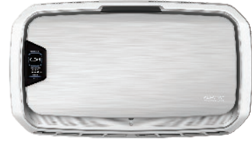
Fellowes® AeraMax® Pro AM4 Air Purifier

19.6" h x 20.9" w x 9" d 300-550 sq ft. coverage* 5 Year Warranty 20.2 lbs. | 2 amp