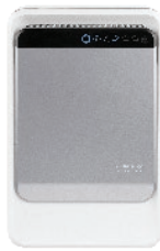
Fellowes® AeraMax® Pro AM2 Air Purifier

Constructed with superior components, high-grade filters and reinforced housing.